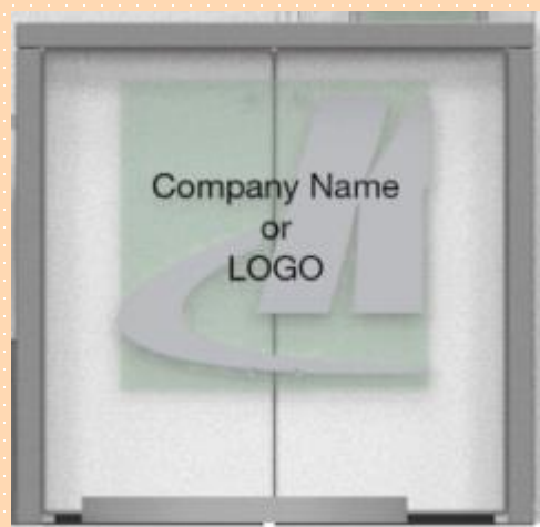
Turnkey Lockable Counter