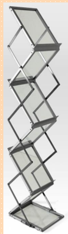
Zig Zag Literature Holder