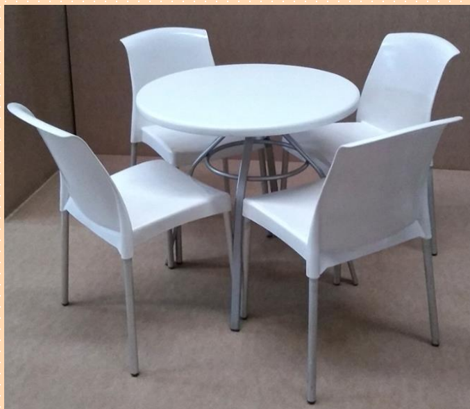
Table and Chair