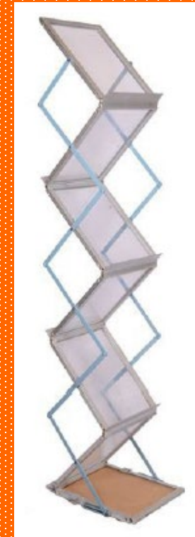
#19 Brochure Holder