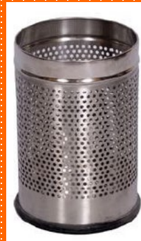
#30 Waste Basket