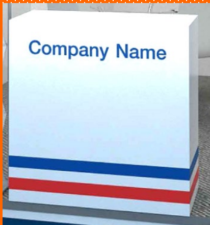
#31 Lockable Counter