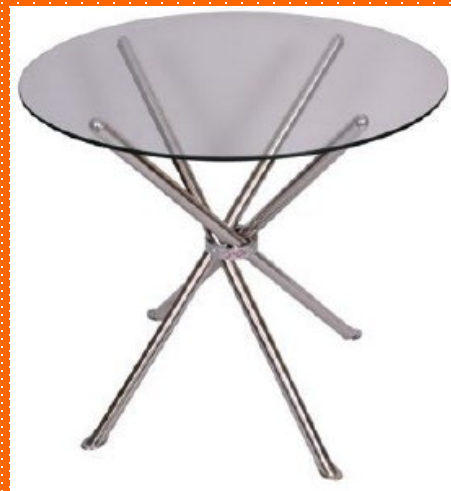
#10 Glass Top Table