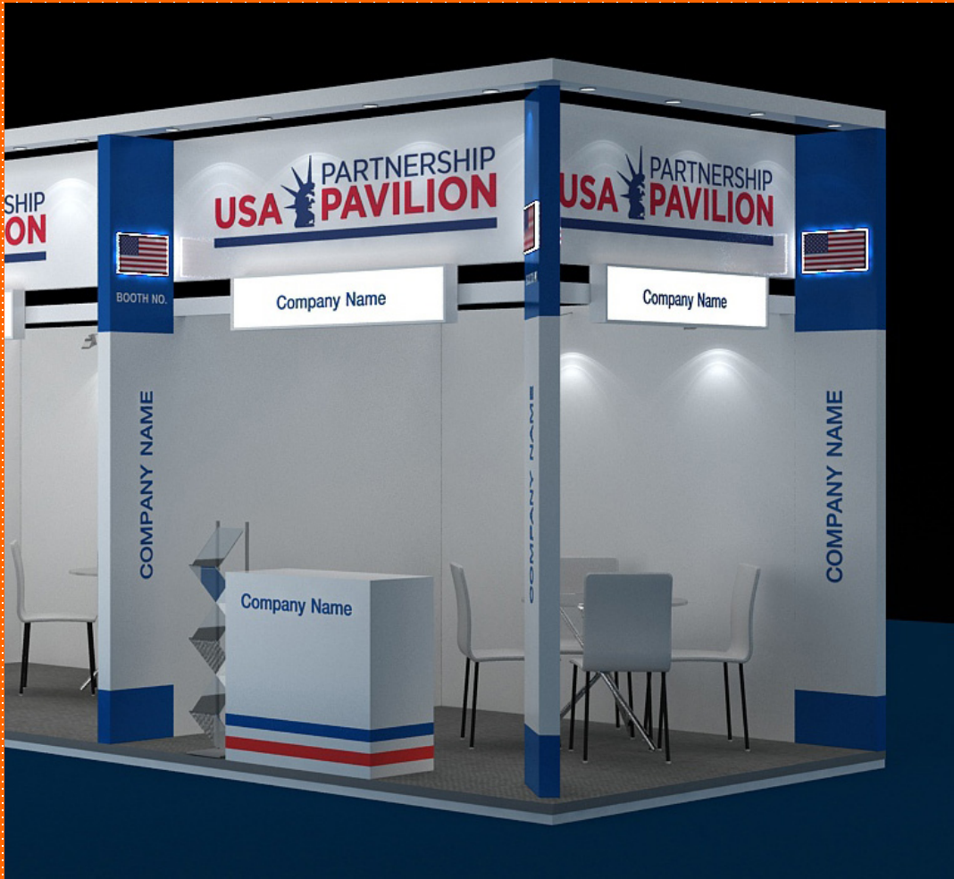
Stand design subject to change at organizer's discretion