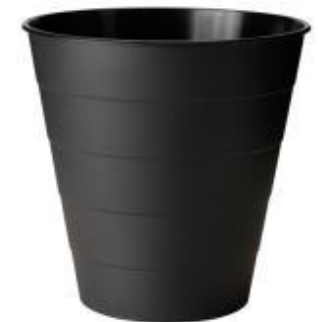
WAS1 Waste Bin