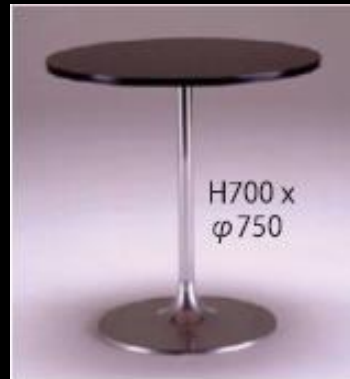
L-6 Café Table