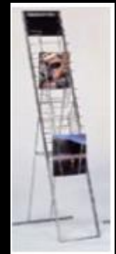
L-9 Catalogue Rack (A4 paper)

Furniture options subject to change at organizer's discretion.