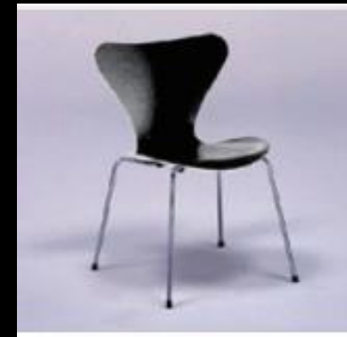
L-3 Stacking Chair