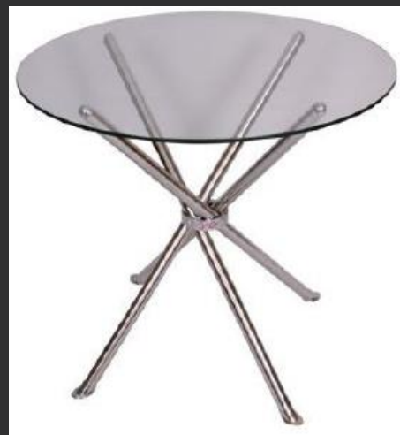
#10 Glass Top Table