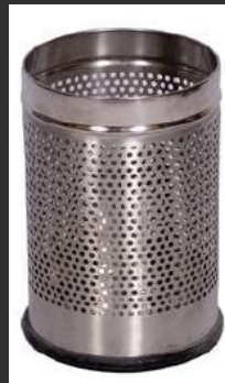
#30 Waste Basket