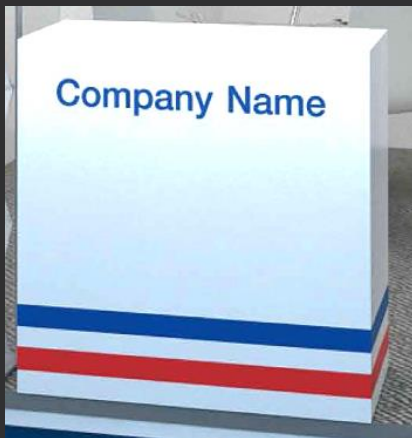
#31 Lockable Counter