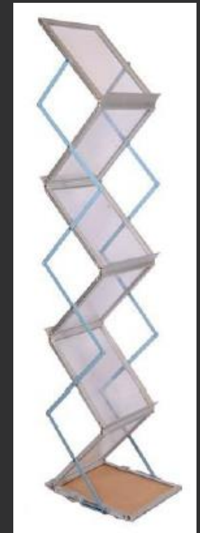
#19 Brochure Holder