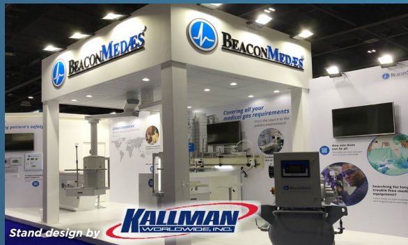
Whatever you want to build, wherever you want to build it, make Kallman Creative Services your custom stand partner.