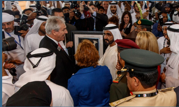
The USA Partnership Pavilion is a top destination for every delegation.

If it's on our schedule, you're invited. As an exhibitor you have exclusive access to USA Partnership Pavilion events, including our Opening Ceremony and Ribbon-Cutting, off- and on-site VIP and hospitality receptions, business and market insight briefings and special presentations.